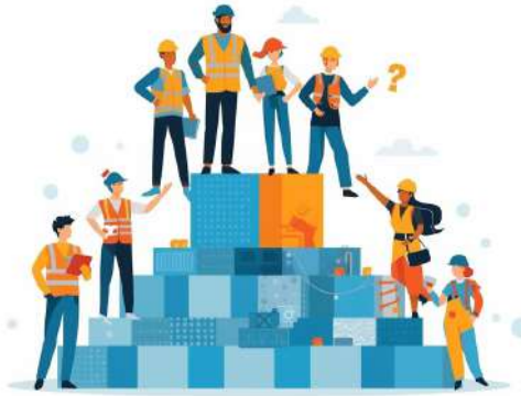
Health and Safety Commitment A Foundation of Our Work