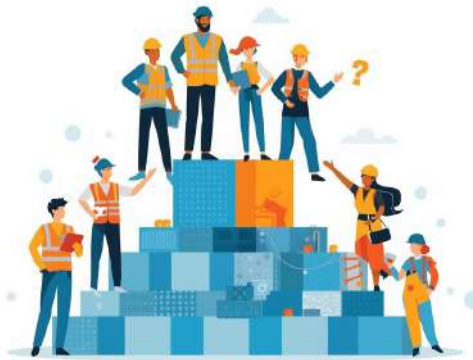
Health and Safety Commitment A Foundation of Our Work